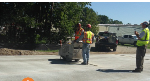
3 Cutting joints in RCC with a soft-cut saw.

The Georgia Department of Transportation (GDOT) has placed thousands of square yards of roller-compacted concrete (RCC) over the past several years, primarily on shoulders of Georgia interstates. In fact a recent nationwide survey by the Portland Cement Association (PCA) showed that Georgia has placed more RCC than any other state transportation department in the country. Last fall, GDOT had the opportunity to bid a local project that was a good candidate for RCC pavement. The use of RCC will increase the structural capacity of the road in order to handle heavy trucks and spur new industrial and commercial development.