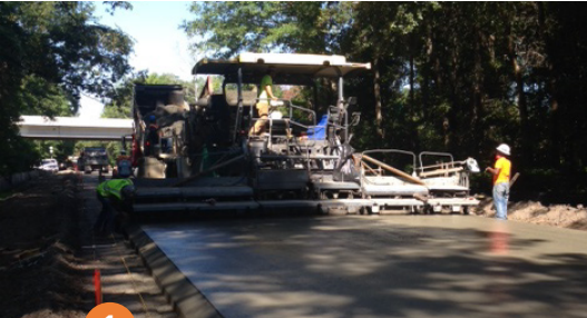
1 ABG paver making a single pass on the entire width of road.