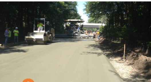
2 Crossgate Road under construction.