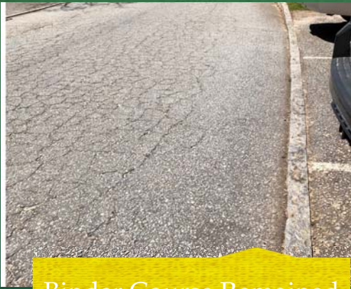
Binder Course Remained Exposed 15 years