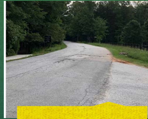
Thin Lift Failure